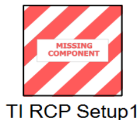
Figure 2. Missing component icon.

In that case, TI Library Updater can be useful. User can drag-and-drop it from Legacy category of the TI C2000 Toolbox library. After a model (.tse) file is provided to the component, it will create a new model with the same name and “_updated” suffix added. It will save it to the same location where the original model is. Basically, a model will be copied, but the library name will be changed to be compatible with the new version of the toolbox. The original model remains unchanged. The updated model can now be loaded with the new version of the library.